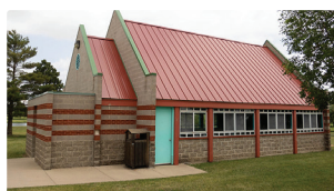
Swimming Pool Shelter ($50/day)