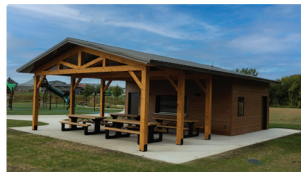
Woudstra Family Park Shelter ($50/day)