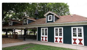
Windmill Park Shelter ($50/day)

For descriptions of the shelter houses, or to reserve a shelter house ONLINE ONLY , scan the QR code, or go to: orangecityiowa.com/shelter-houses/reserve-campsites-shelter-houses