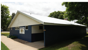
Vets Park Scout House ($50/day)

The arrival of summer means picnics, reunions, and outdoor birthday parties. After being inside all winter, we can all agree outdoors is the place to be. For a very inexpensive "get away", Orange City has five shelters which are available to rent for your group activities. All of these City-owned facilities have a refrigerator, stove, sink, and counters.