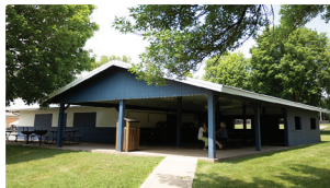
Vets Park Shelter ($50/day)